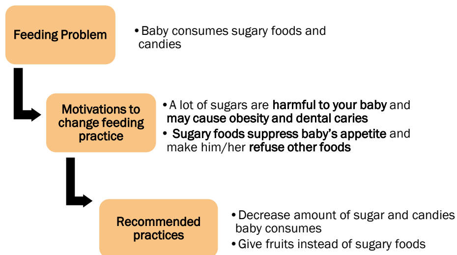
Figure 3. Motivations and recommended practices to address sugary foods and candies as a feeding problem