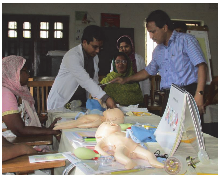
HBB in-service training in Pirgonj Upazila Health Complex

HBB approach to birth asphyxia management versus pre-HBB approach in Bangladesh: HBB stakeholders in Bangladesh all stated that the HBB approach is very similar to the approach to resuscitation management that they had been taught previously. They said that HBB provides a clear, standard approach for managing a newborn during the Golden Minute and simplified resuscitation procedures for newborns requiring assistance. The HBB approach puts the focus on the newborn during this crucial moment and directs the provider to first check that the newborn is breathing properly and only then proceed to other tasks such as cutting the cord.