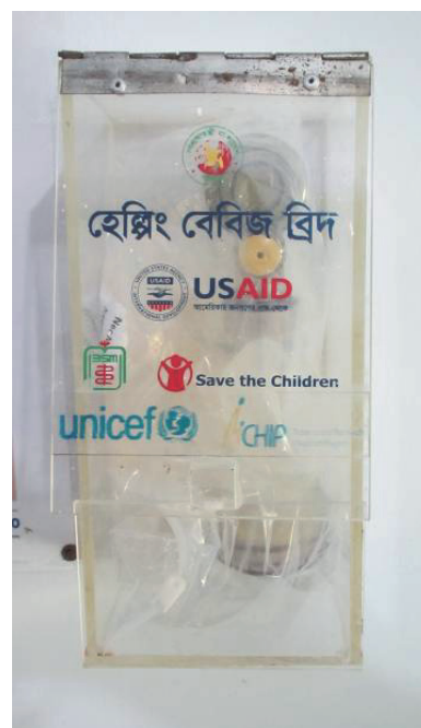
HBB Plexiglas box