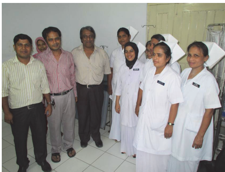
HBB Team in Pirgonj Upazila Health Complex

The health system in Bangladesh is complex, with services provided by the MOHFW, nongovernmental organizations (NGOs), and private-sector health care workers, in addition to traditional providers at the community level. The MOHFW is divided into two directorates, each of which delivers health services. The Directorate General of Health Services (DGHS) focuses on curative services and oversees tertiary care facilities at the medical colleges, secondary care at district hospitals, and some primary care services—both at sub-district health centers and at the community level. Female health assistants (FHAs) are a