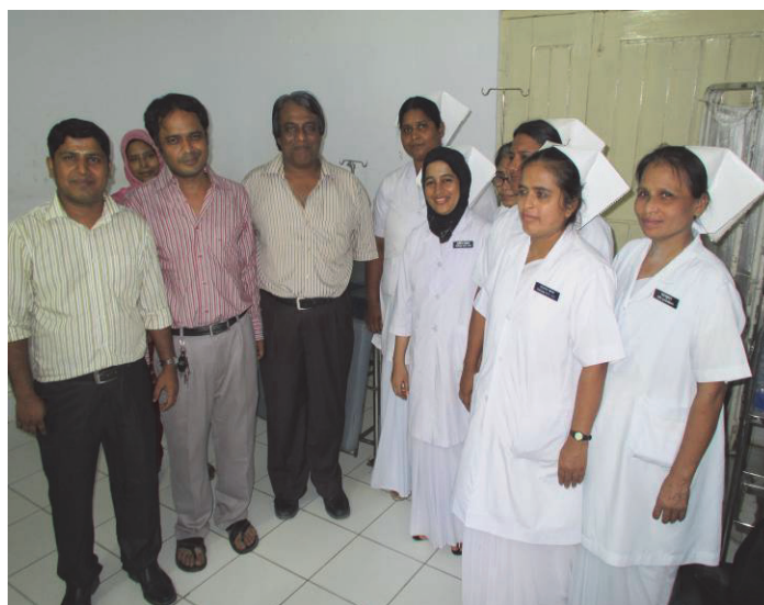
HBB Team in Pirgonj Upazila Health Complex, Bangladesh

Scaling up HBB—information requirements: The newborn public health community needs to learn more about scale-up in general and scaling up HBB in particular. At first glance, it may appear that HBB can save lives as a straightforward training program but it may require support from various components of the health system to achieve impact. Additional evaluations of HBB programs implemented at scale would contribute to a greater understanding of how HBB performs when it is rolled out. HBB programming efforts would also benefit from learning more about how HBB is actually taken to scale. Quantitative evaluation results will be easier to understand and interpret when they are complemented by a documentation of how HBB is implemented during scale up and what