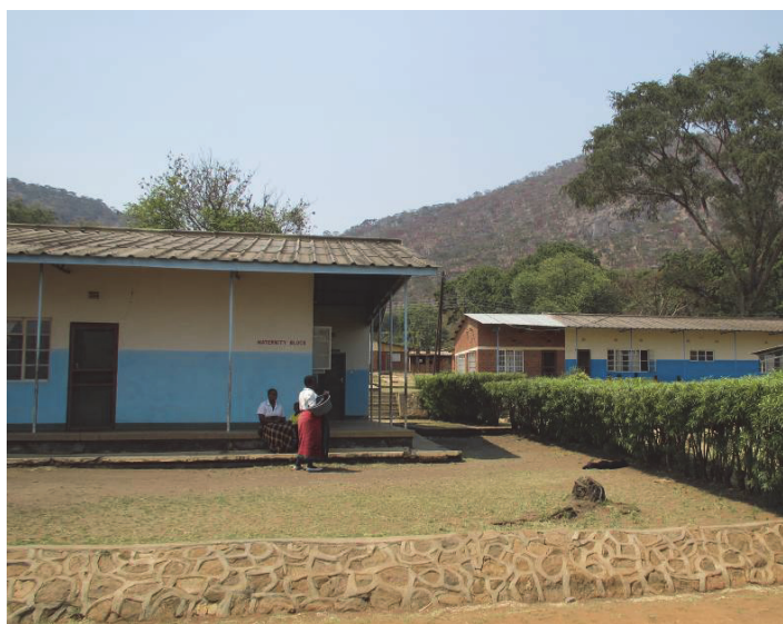
Health center in Dedza district, Malawi

Both Bangladesh and Malawi are countries that are on track to achieve MDG4 and are thus countries with a track record of progress in public health. A review of the factors listed in Table 1 reveals opportunities and challenges. There is evidence in both countries that birth attendants have inadequate knowledge or skills in resuscitation and thus HBB holds the potential for improving performance of resuscitation. Despite being more prosperous (based on GDP), Bangladeshis demonstrate a lower demand for maternal health care than Malawians. Given the high preference for private delivery services in Bangladesh, the data suggest some dissatisfaction with maternal health services provided by the government.