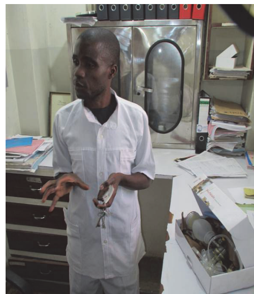
Nurse-Midwife Technician with HBB equipment in Malawi

Policies regarding provision of resuscitation equipment: Bangladesh and Malawi have developed policies regarding the type and quantity of equipment that should be supplied to each type of facility (see country reports for details). HBB equipment is supposed to be provided to a facility immediately after the first provider from that facility completes the HBB training. Each country has defined two sets of resuscitation equipment that are relevant to the implementation of HBB: (1) training equipment , that is to be used for simulated practice and training at worksites (i.e., not on live newborns), which consists of a NeoNatalie mannequin, a penguin sucker, an ambu bag and two masks—size “0” and “1”; and (2) service equipment that is used in the delivery ward or operating theater to resuscitate distressed newborns. Service equipment is the same as training equipment minus the mannequin.