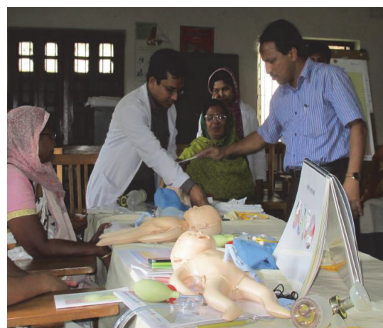
HBB in-service training in Pirgonj Upazila, Health Complex, Bangladesh

Due to financial limitations, the HBB program in Malawi decided to train only 30 SBAs per district (later changed to 30 percent of SBAs per district) and at least one provider per facility. While some districts have been able to train a higher percentage of providers, there remains a substantial percentage of SBAs currently working in delivery wards who have not been formally trained in HBB. Providers who have been trained in HBB are told to return to their own facilities and train their coworkers in HBB but this approach appears to have generated little enthusiasm and has not been as successful as was envisioned. Nurse-Midwife Technicians have continued to be prioritized for participation in HBB training as they perform the vast majority of deliveries. Other types of providers, including anesthetists, pediatricians and obstetricians, are also trained once adequate coverage of Nurse-Midwife Technicians has been achieved. Providers from facilities run by the government and CHAM, which together perform over 99 percent of facility deliveries in Malawi, receive equal priority for participation in training.