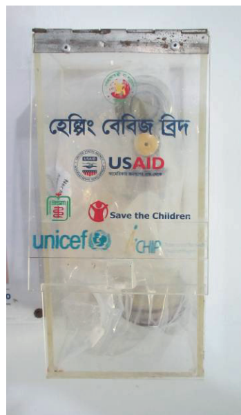
HBB Plexiglas box mounted on a wall in a health facility in Bangladesh

In contrast, the Malawi HBB initiative has experienced perhaps its greatest implementation challenges with regard to the provision of equipment to facilities where trained providers work. Although the MOH had originally pledged to procure HBB service equipment for all facilities, it was unable to fulfill its commitment due to an unforeseen funding crisis. When it became clear early in the HBB initiative that there was a lack of funding for equipment, the MOH and its partners took the decision to proceed with HBB training even though equipment could not be supplied as planned.